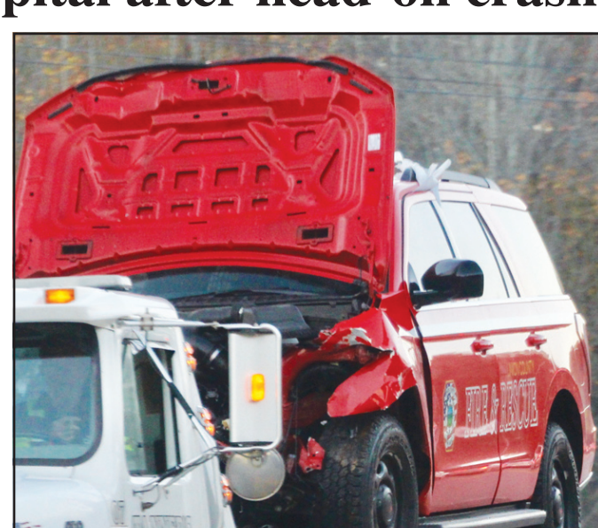
The Fire Department's Ford Expedition being transported from the scene of a Nov. 1 crash on Murphy Highway.

Both firefighters were treated for minor injuries and released later that evening, and