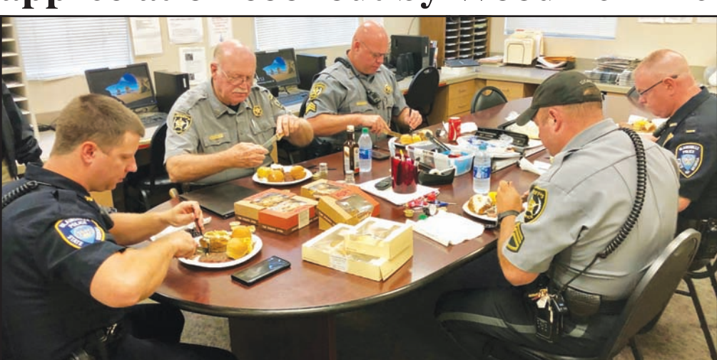
Union County Sheriff's deputies and Blairsville Police officers breaking bread during their WoodmenLife-sponsored appreciation lunch last week.