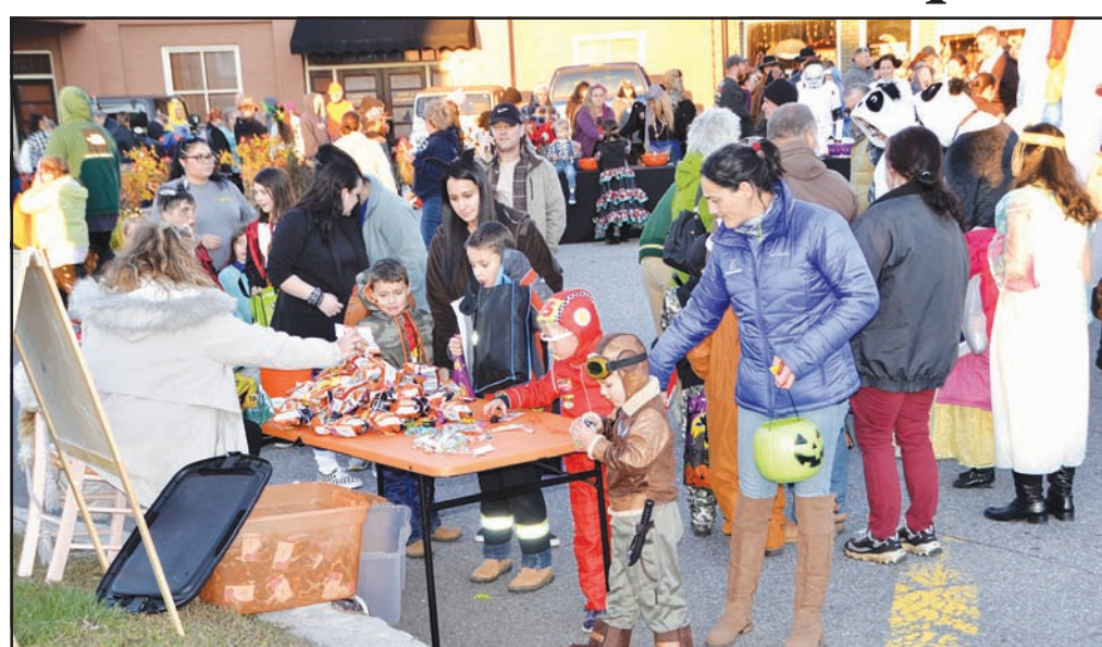
Hundreds and hundreds of costumed children flocked to the Blairsville Square to trick or treat for Hometown Halloween on Nov. 2.